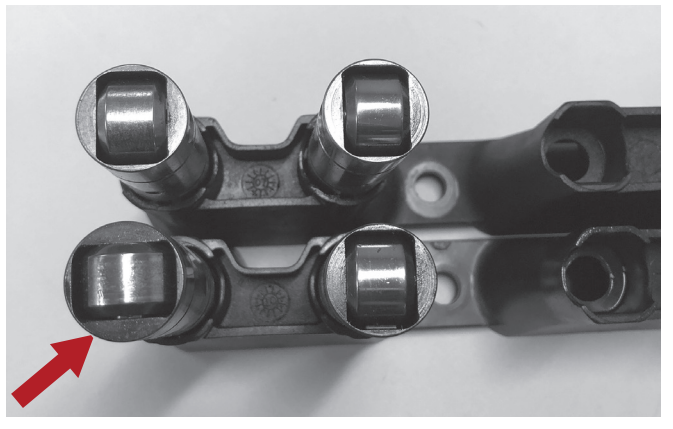
FIG 1: Worn Lifter Guide/Misaligned Roller

A lifter stuck in the compressed position may be the result of cylinder activation during the improper position of the camshaft lobe. Activation should occur when the lifter is at the base of the camshaft lobe and not on the ramp or lobe peak. If the AFM lifter unlocks as soon as the engine is started, low compression will result on that cylinder and a misfire code will be stored. Collapsed or stuck AFM lifters due to oil contamination will result in the same. Contamination/sludge is a major concern, prompting some to re-evaluate mileage service intervals.