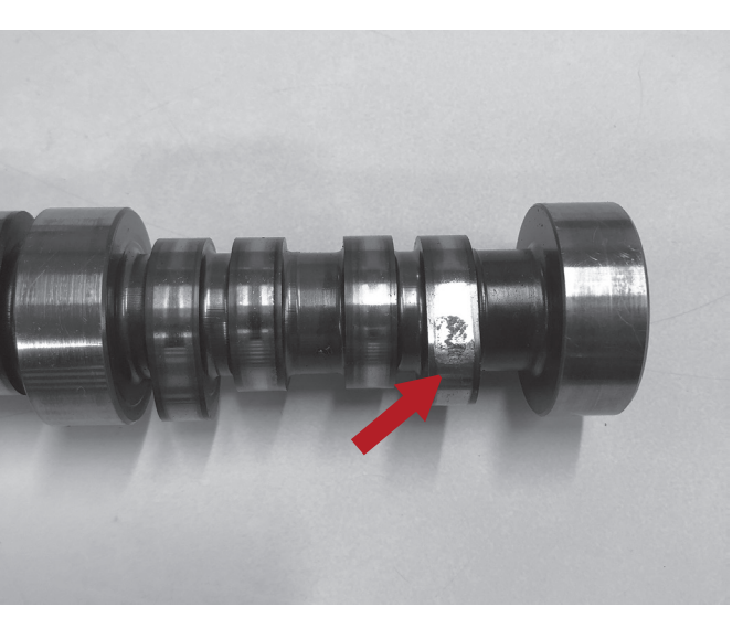
FIG 3: Camshaft Lobe Wear

3) Wear on the camshaft lobes may require removal of the camshaft for a thorough visual inspection.