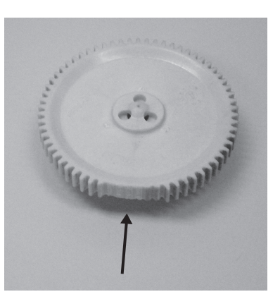
Detail of damaged plastic gear shown in Fig. 1

c o n t a m i n a t i o n. The vehicle owner acknowledged that a stumble or hesitation had been evident for several weeks. It wasn't until the ETC motor started emitting a growling sound from the stripped plastic gear during startup, that the owner determined that a trip to the repair shop would be necessary.